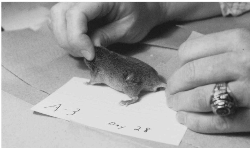
Fig. 3. Twenty-eight days after injection.

cases, the ulceration grew extremely large (Figure 5) then appeared to implode (not shown), and the wound closed. The mice then lived their normal life span of approximately 2 years. In the figures, the index card notation "A-3" identifies the mouse, and the day number indicates elapsed time since injection. In